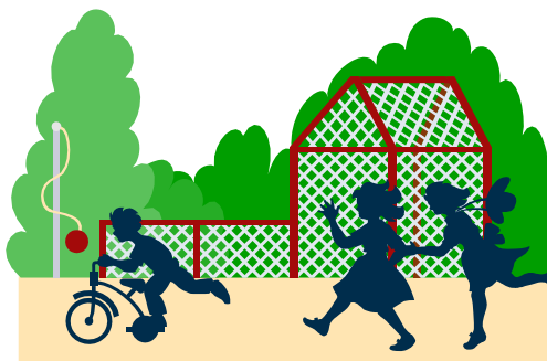
Lots of playground fun for every child.

Your registration form must be accompanied by a camp registration fee of $30.00 cash or a check made payable to St. Thomas' Nursery School. This will go towards your camp tuition.