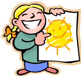
Your child will complete a theme-based craft project each day.

In the event of inclement weather we have an indoor play space with scooters, a moon bounce, and many other indoor activities.