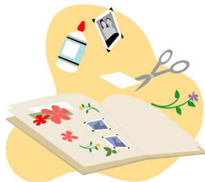
Your child will complete a theme-based craft project each day.

Children attending the camp must be successfully potty-trained. No diapers/pull-ups are allowed.